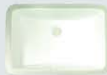
Undermount Rectangle Outside Dim. 20½ x 14¼ x 8 VBM8006-20 Bisque VBM8006-10 White

USE SAME OVAL AND RECTANGLE SINKS AS OUR PROGRAM