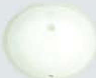
Undermount Oval Outside Dim. 19¼ x 15¼ x 8¼ VB7028-20 Bisque VB7028-10 White