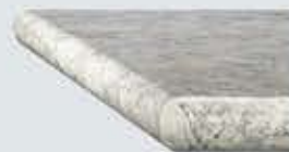
Crescent (softly rounded)