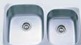
60/40 M2300L or M2300R Out Dim. 32¼ x 20¾ x 9&7 Lt Bowl: 15½ x 18¾ x 9 Rt Bowl: 13½ x 16½ x 7

USE SAME OVAL AND RECTANGLE SINKS AS OUR PROGRAM