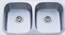
Equal Double Bowl M2200 Out Dim. 32½ x 18½ x 9 Bowl Size: 14½ x 16¼ x 9