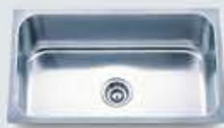
Big Basin M2509 Out Dim. 31½ x 18½ x 9

USE THE SAME 3 STAINLESS STEEL SINKS AS OUR PROGRAM